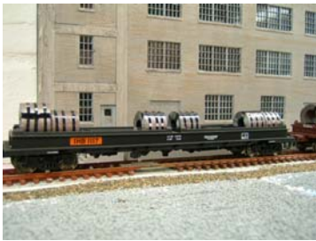
Modeling tip and photo by Gary Zillyette

Do you have steel coils on your layout? Want to help make them look more realistic? Put some banding around them like the steel mills do. I use the smallest size black vinyl pin striping for cars to make mine. I usually put 3 around the outside, then 3 to 4 through the center and then wrap it perpendicular to the ones you already put on. This makes an interesting look on your layout and will be sure to make those steel coils look like they are ready to unwind.